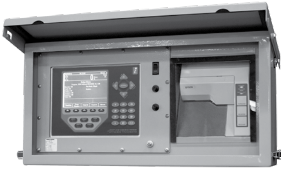
920i On-board Weigh Center