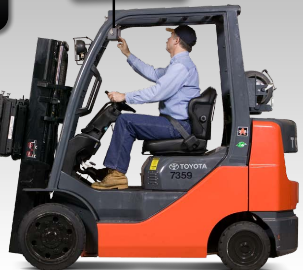
FLSC Forklift Scale with FLI 225 In-Cab Instrument